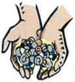
Joyful Noise Offering